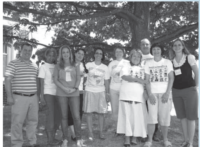
Participants from two of CLEAR's professional development workshops take a break to enjoy the Michigan summer.